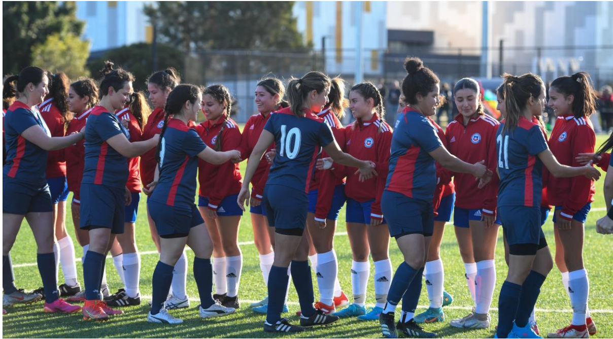
2022 – Cuba v Chile – Copyright: Organising Committee (Rob Cruse Photography)