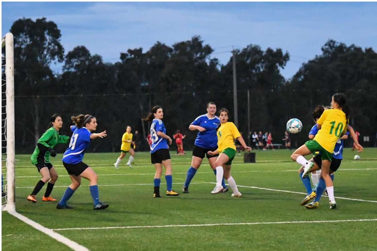
2022 – Iceland v Australia